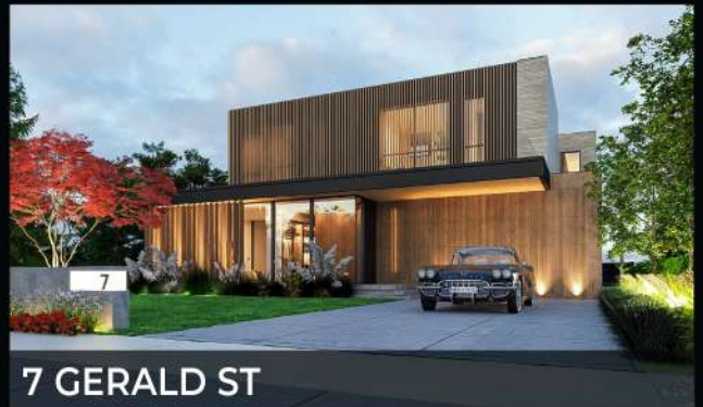
7 GERALD ST