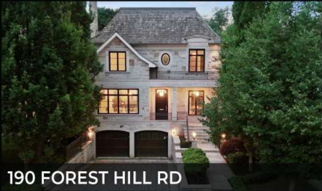
190 FOREST HILL RD