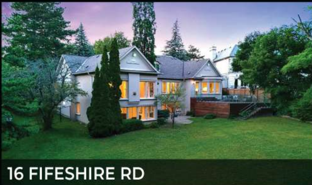
16 FIFESHIRE RD