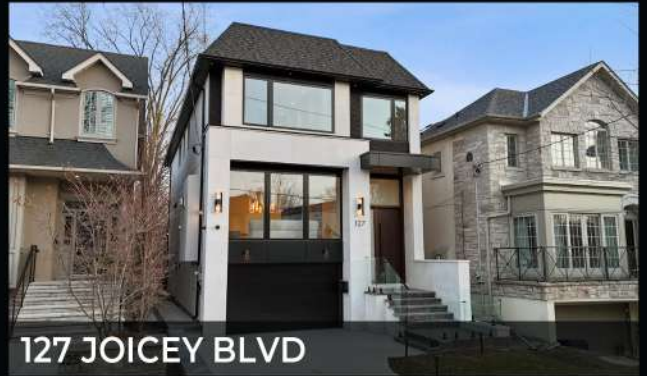
127 JOICEY BLVD