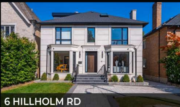
6 HILLHOLM RD