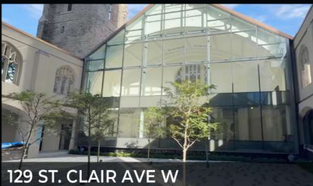
129 ST. CLAIR AVE W