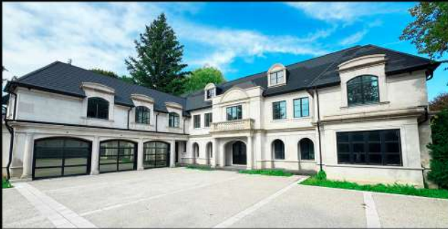
100 BAYVIEW RIDGE