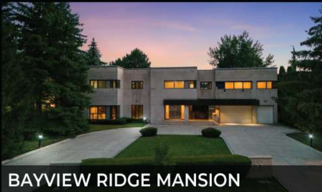
BAYVIEW RIDGE MANSION