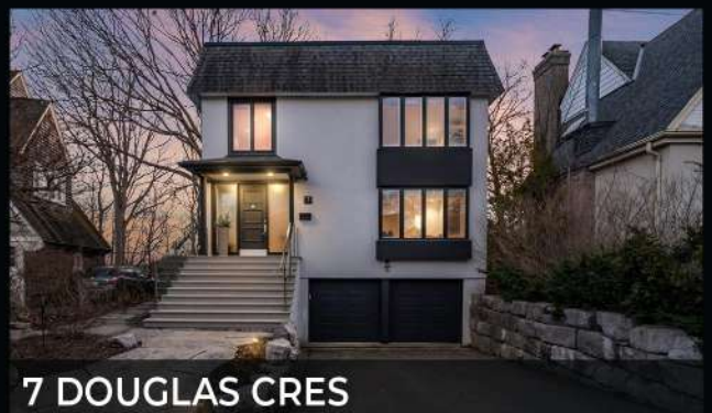
7 DOUGLAS CRES